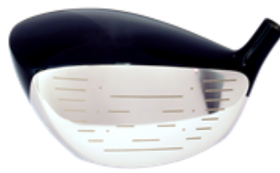
# 4 final product of the driver head

Welding and cutting described are performed in a 4 station system installed by ProArc. It uses one DPSSL from ROFIN offering 2 kW maximum power which is time-shared (switched) into 2 fibres. Each fibre is connected to one robot which serves two stations each. The system is shown in # 5.