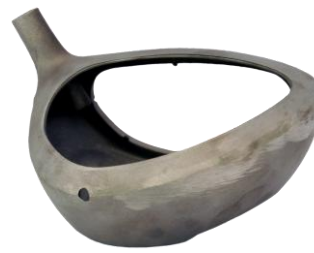
# 2 casted head after laser cut