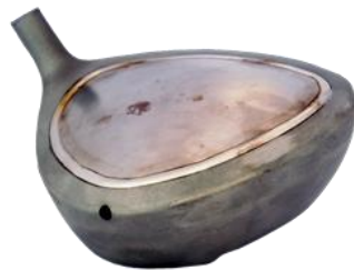
# 3 club head after first welding