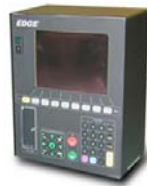
EDGE II CONTROLLER

Advance PC-base CNC controller 566 MHz Intel Celeron Processor 256 MB of RAM, 20 GB HD 10.4" VGA active matrix color LCD screen, 1.44 MB floppy drive Windows XP operating system