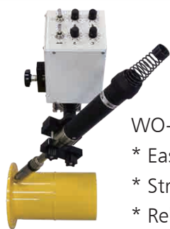
WO-150 Oscillator * Easy * Strong * Reliable