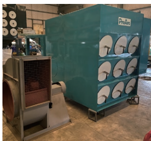
Eco-friendly dust collector