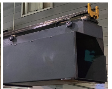
Fume collection duct

Year 2021 Actual usage condition: On site image taken after installation.