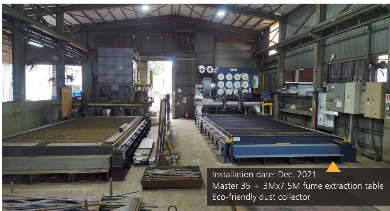
Installation date: Dec. 2021 Master 35 + 3Mx7.5M fume extraction table Eco-friendly dust collector

Ten years later, ProArc has a more complete improved product line. We incorporate a fume extraction table and eco-friendly dust collectors into our own product line that provides customer with "Total Cutting Solution".