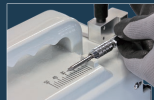
• Length scale