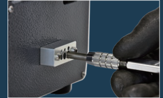
• Tip flat block