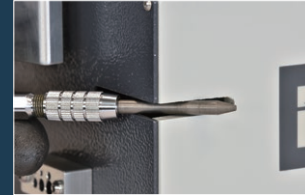
• Notching function