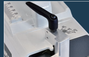
• Angle scale